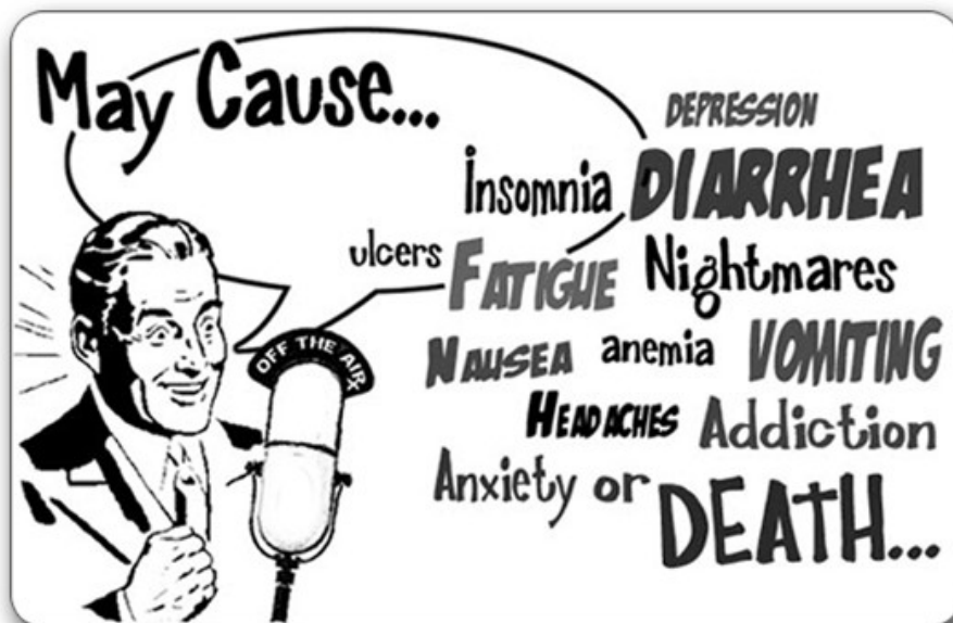
Figure 1: List of Panaceaxyl TM side effects, as reported in 0.1 sec by the drug's commercial.

William just got an aggressive form of the seasonal flu, and the doctor prescribed him a broad-spectrum antibiotic to fight it, the Panaceaxyl TM . This antibiotic has to be assumed in a strictly controlled pattern, exactly once every T hours, until the flu is defeated: never stop a treatment early, or the illness will get much worse! Even the slightest transgression to the prescription, such as anticipating the timing by just a few minutes, might result in one of the numerous Panaceaxyl TM side effects.