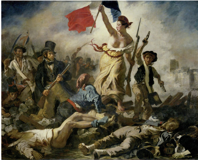
Figure 1: The earliest known reportage of a capture-the-flag game (E. Delacroix, 1830).