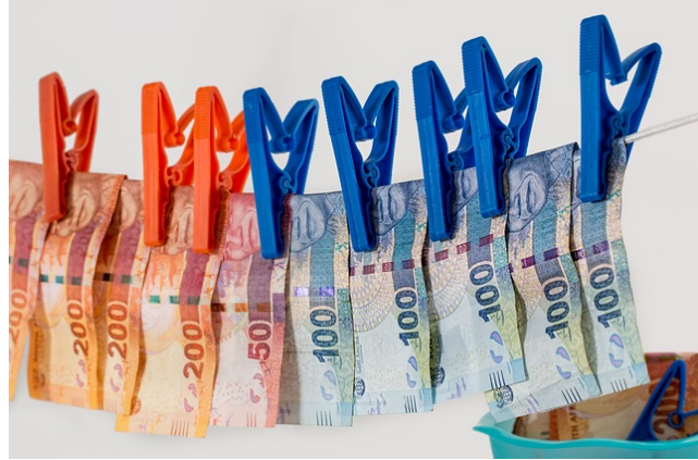
Figure 1: The long line of bribes, to be taken in turns.

In any case, taking items from the interior of the line is never allowed.