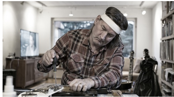
Figure 1: Doing chores can be very tedious.

Among the attachments of this task you may find a template file chores.* with a sample incomplete implementation.